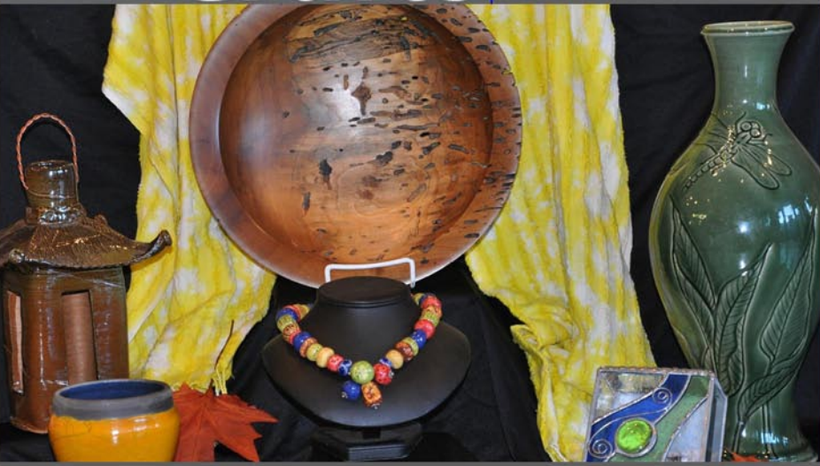
find wonderful things, all designed and created by South Carolina Artists.