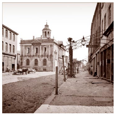
1865 Post Office

Some of these photographs were originally taken with large glass plates, while