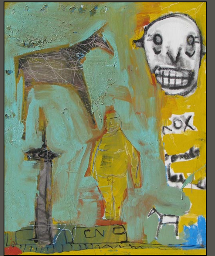
XONON Oil on Canvas 31 x 36 inches Casey McGlynn

EyeLevel Art and Artistic Spirit Gallery, in Charleston, SC, are collaborating on this Visionary art show offering the chance to collect "Outsider Art*" from nationally known artists.