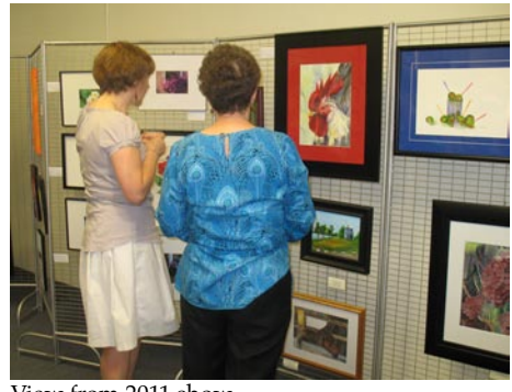
View from 2011 show

The annual pop-up gallery and temporary artist cooperative is dedicated to presenting works by many artists of varied backgrounds in a diverse array of media and styles, from representational to contemporary, in both two and three dimensions. All pieces on display will be available for sale. Artwork ranges from