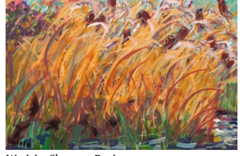
Work by Shannon Bueker

This solo exhibition of new paintings by Bueker portrays the grasses, woodlands and flowers of spring in NC.