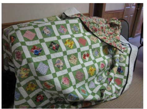
A Walk in the Garden quilt

Using the pattern created by the local quilters, and their own fabric, the Island Quilt members pieced over 140 floral blocks that were used in the quilt. At a guild meeting and at Marsha Korpanty's house, The Island Quilters pieced the