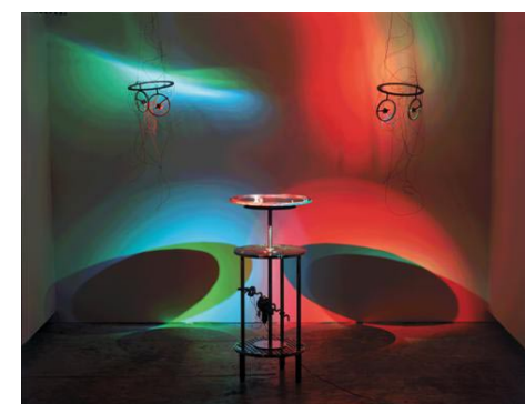
Work by Kit Kube

Kinetic sculpture is defined as threedimensional artwork with parts that move, or are in motion. The motion of the work can be provided in varied ways - through elemental forces, mechanics or human interaction. A notable example of kinetic sculpture in Charlotte is Cascade by Jean Tinguely, currently displayed in the lobby of the Carillon building. Kube was