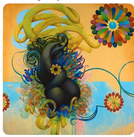
Work by Daniel Nevins

The Cabarrus Arts Council in Concord, NC, is presenting The Edge , an art exhibition that includes cutting edge pieces and modern approaches, on view at The Galleries through May 16, 2013.