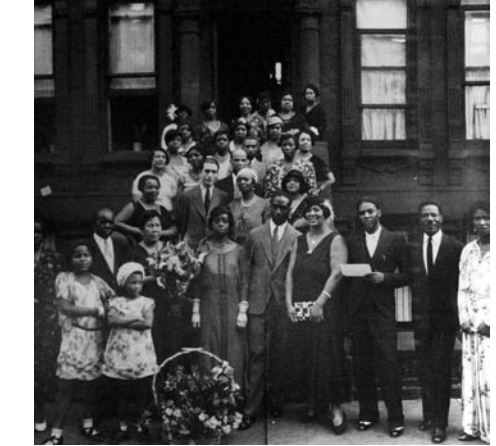
Family Group Outside Brownstone, 1920s'.

The exhibition opening at Penn Center contains selections from the collection donated to the Stanback Museum by the New York Public Library's Schomburg Center for Research in Black Culture, where it was housed following the closing of the exhibition at the Metropolitan Museum of