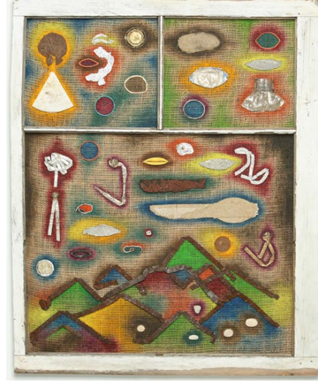
Work by Destry Sparks

versity. He attaches worn found objects to burlap, wood pallets and window screens by discreet use of industrial adhesives. Sparks paints around these objects to create a visceral surface effect atypical to traditional painting. Inspiration for his work comes from diverse sources including traditional African and Aboriginal craftsmen to contemporary masters Anselm Kiefer, El Anatsui and Gregory Amenoff.