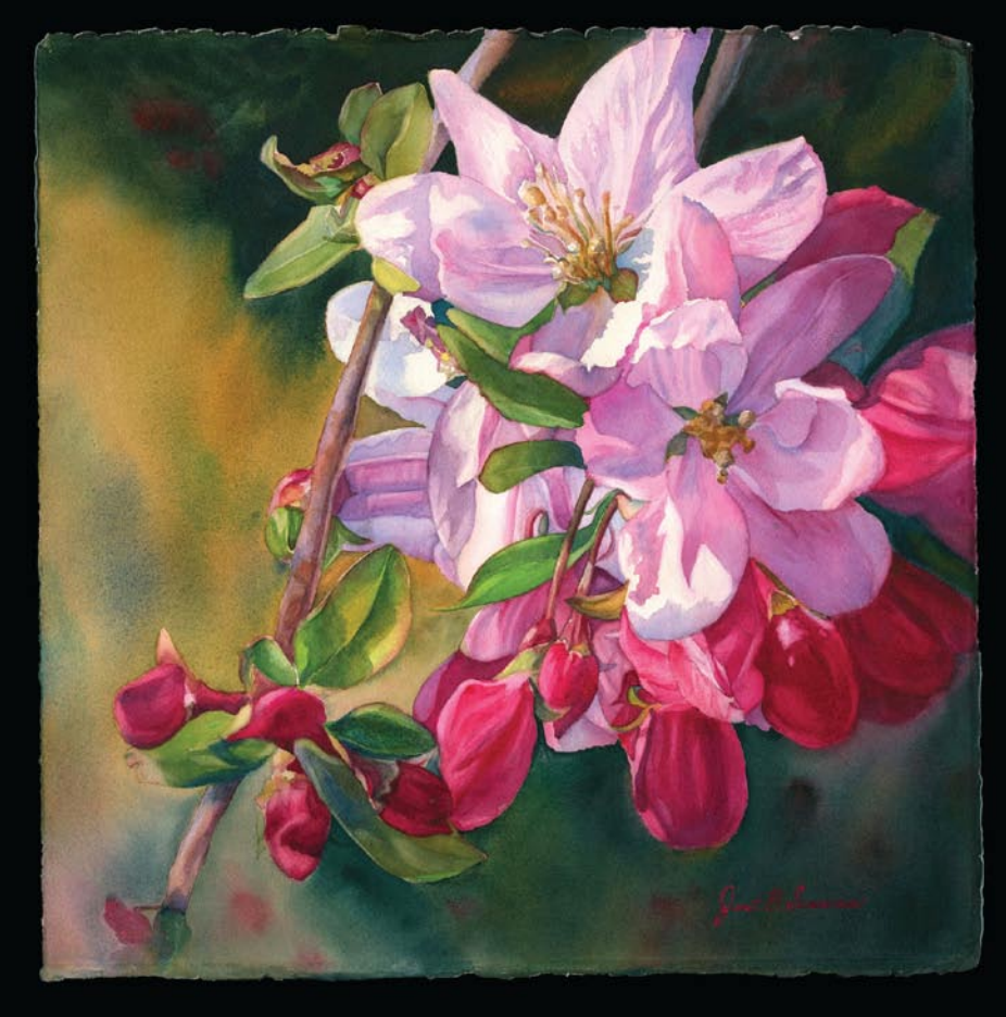
Wilmington Art Association

For further information check our NC Commercial Gallery listings, call ACME Art Studios at 910/232-0823.