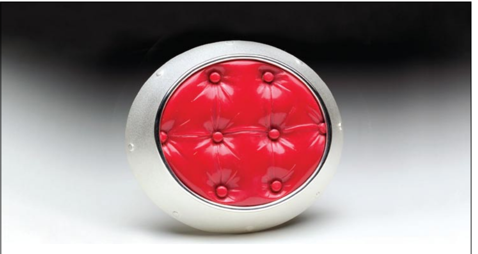
THERE'S A FINE LINE BETWEEN PRICELESS AND WORTHLESS