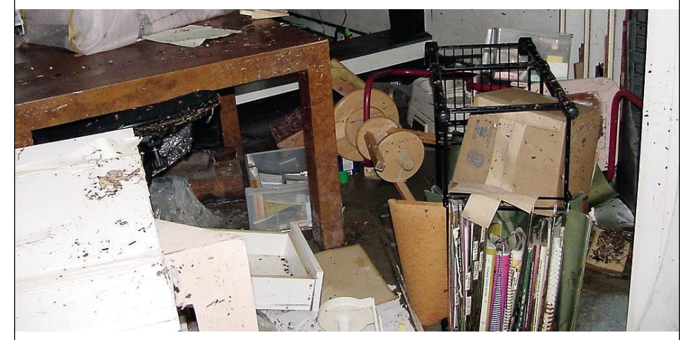
Artist Diane Falkenhagen's Texas studio — destroyed by flooding during Hurricane Ike, 2008

What would you do if you lost your work, your tools, your images, and a lot more to a flood? Metalsmith Diane Falkenhagen knows