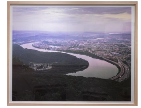
Work by Jeff Rich

After the photoshoot, the unharmed fish were released into a small pond in the artist's back yard.) Lee's process often involves weeks of observation to create a single image. The artist even pays homage to Dali, Picasso, and Da Vinci in Dance of the Caterpillar Stalker Beetle 2. In Pablo's Muse the skin of a praying mantis acts as a stand-in for Picasso's Seated Woman. 3. In Vitruvian Wasp, a female mud-dauber wasp becomes the mirror image of Leonardo Da