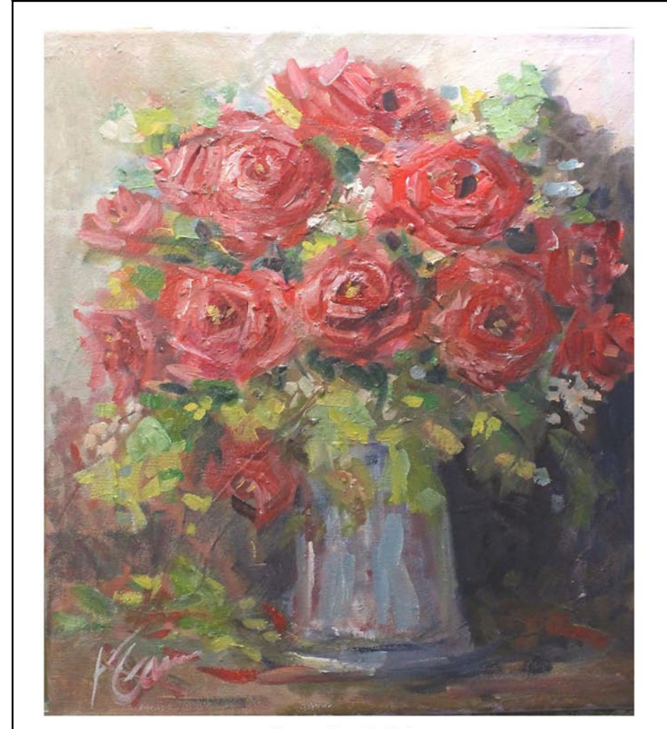
Save the Date! The Treasure Nest Art Gallery Spring Art Collectors Show May 14, 2016