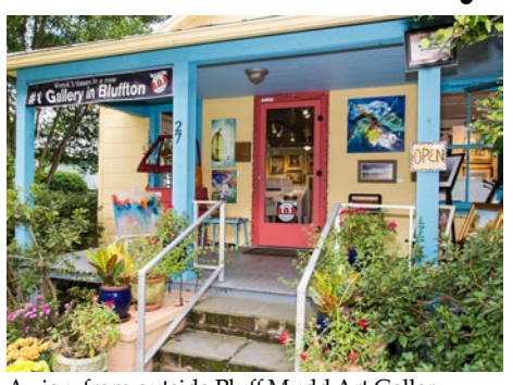
A view from outside Pluff Mudd Art Gallery

This co-op gallery opened in the old Mercantile Building in 2002 under the name, "A Guild of Bluffton Artists". Four years later it became Pluff Mudd Art and moved across the street to its present location in the little yellow cottage at 27 Calhoun Street. The gallery features 23 local artists from Bluffton, Beaufort and Hilton Head and offers a variety of mediums: watercolor, oil, and acrylic painting, photography, jewelry, pottery, wood arts, fiber art, glass, sweet grass baskets, and metal. Little wonder this gallery has been voted the best and most eclectic gallery in