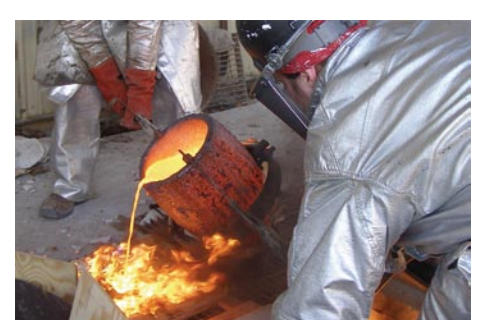
Sand scratch molds filled at iron pour.

Sand scratch molds are $30 per block and all tools and metal will be provided. Bring your own sand molds and have them poured for the cost of the metal. You can pay onsite. Please RSVP by e-mail to (melissa@carolinabronze.com) or call 336/873-8291 if you plan on participating in the metal pour so we can be sure to have enough supplies and