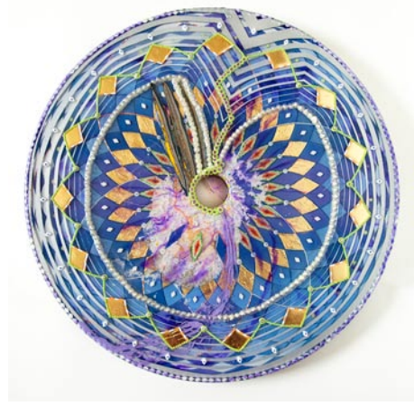
Work by Elizabeth / Sidebotham

Heavily influenced by the coastal landscape and roadside attractions from the past and present along the famed highway, Bleicher's photorealistic graphic renderings developed from site sketches and photographs are complemented by metaphorical elements such as maps to signify the journey, as well as found objects from the area. "The King's Highway is not just a place; it is a state of mind," Bleicher explains. This state of mind is at the core of our "American psyche, culture, and history," serving as a