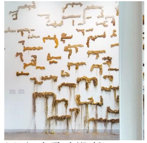
A view from the "Threshold" exhibit.

"Our collective work is inspired by recent and current political events, factions in our country and in the world, and land use and access. Our current work interrogates the uses, maintenance, and funding