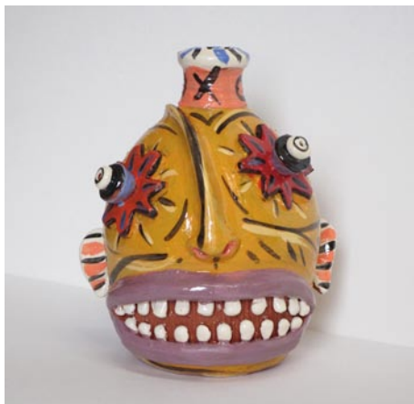
Work by Carl Block

For further information check our NC Commercial Gallery listings, call the gallery at 828/281-2134 or visit (www. amerifolk.com).