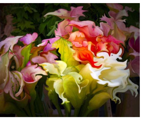
Work by George Watson

Art League Gallery features local artwork in all media created by more than 170 member artists. All artwork on display is for sale and exhibits change every