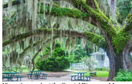
View of grounds at the Coastal Discovery Museum

Hilton Head Island Farmers' Market. The market has plenty of space for shoppers to socially distance themselves while having access to fresh fruit, vegetables, meat, and local goods. By supporting these small businesses, we can also help our local vendors come out of this pandemic as robustly as possible. The market is open at 70 Honey Horn Drive on Tuesdays from 9am to 1pm.