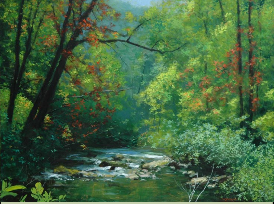
Late Summer on the Chattooga River

For further information check our NC Institutional Gallery listings, call the Center at 828/526-4949 or visit (www.thebascom.org).