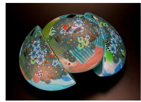
2007 Floral Core Series #125 by Richard Ritter

Ritter's work is included in public and private collections around the world.... most notably in the collections of: The Renwick Gallery of the Smithsonian Institution, the Corning Museum of Glass, The Mint Museum, and the Museum of Art and Design in New York City. Ritter's work can also be found in the Permanent Collection of the Vice President's Residence in Washington, DC, and his work was also included in the first permanent White House Crafts Collection.