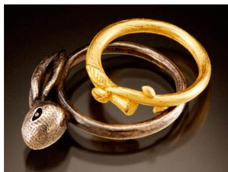
Works by Stacy Lane

ries. From ancient Egypt to modern times the lure of a lidded vessel seems to reach across cultural and geographical boundaries. Their almost seductive nature invites us to question what is concealed, everyday objects, or someone’s most cherished memories.