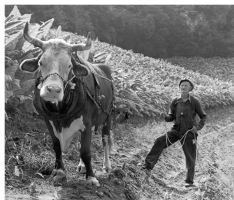
Work by Tim Barnwell

MESH Gallery in Morganton, NC, will present the exhibit, The Face of Appalachia , an exhibition of black & white photography by Asheville-based photographer Tim Barnwell, on view from May 13 through July 1, 2011. A reception will be held on May 13, from 6-8:30pm.