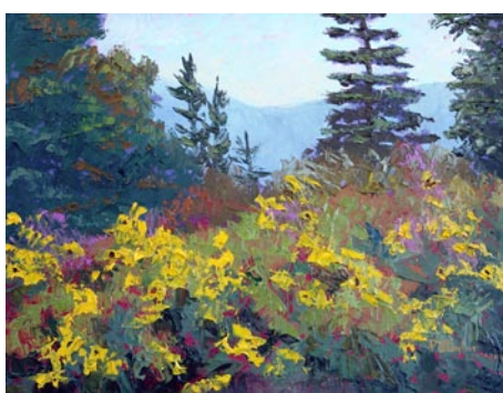
Work by Peggy Horne

The 2011 East of Asheville Studio Spring Tour will take place throughout the winding roads of East Asheville, Swannanoa, Black Mountain and Fairview, NC, on May 14 & 15, 2011, from 10am-6pm