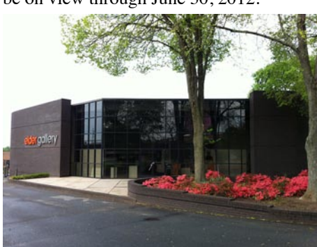
New location at 1520 South Tryon Street