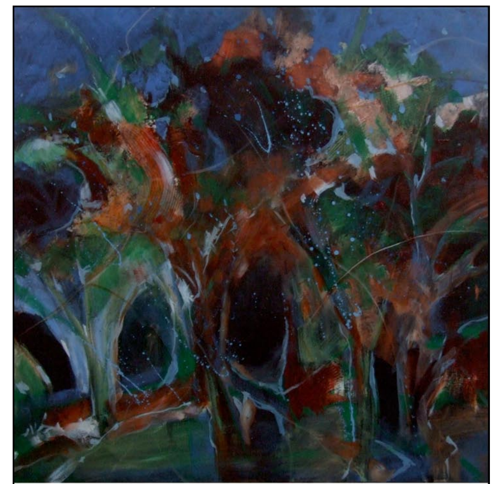
Mysterious Forest • acrylic on canvas • 36" x 36"

For further information check our NC Institutional Gallery listings, call the Museum at 704/337-2000 or visit (www. mintmuseum.org).