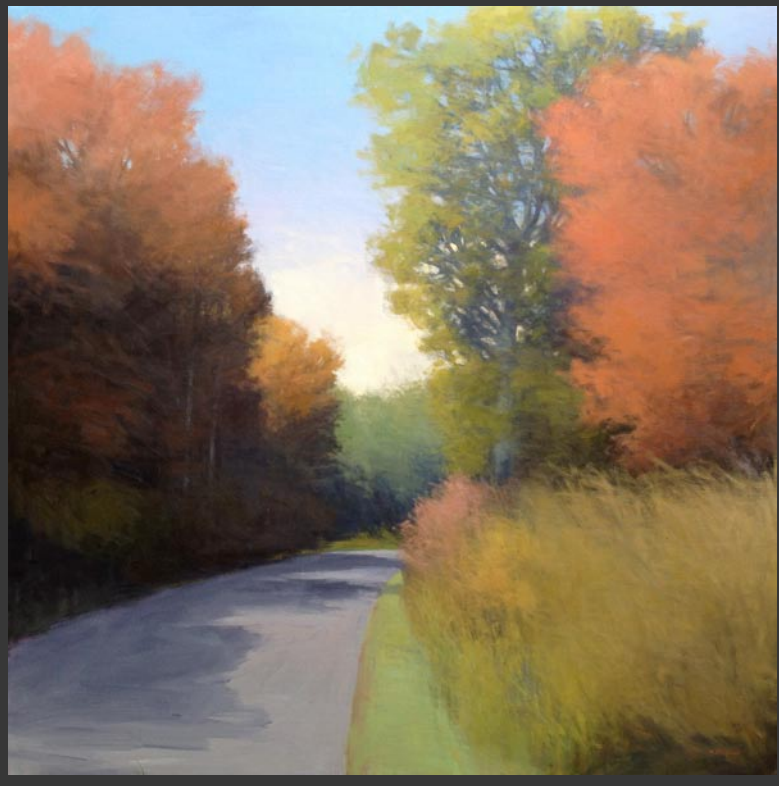
The Seasons are Changing 48" x 48"