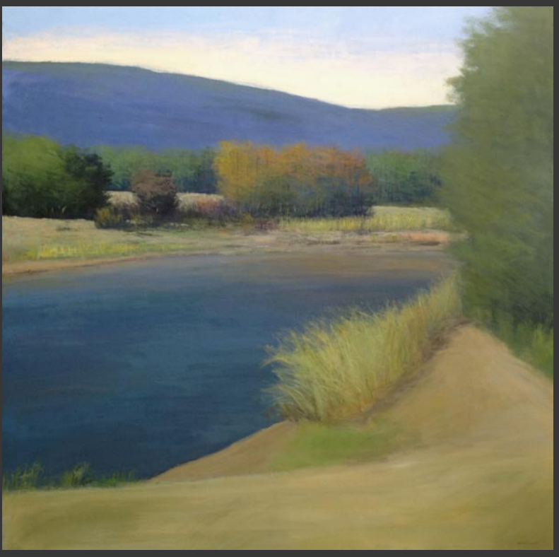
Across the Blue 48″ x 48