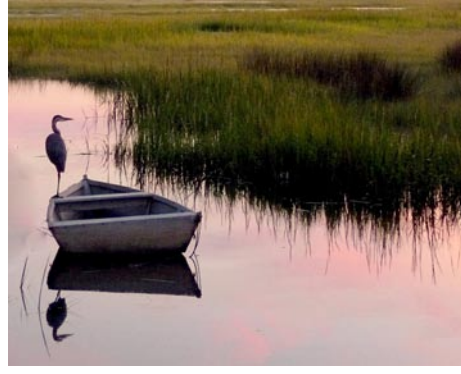
Work by John Parsons

The show will feature over 100 photographs, both digital and film, taken by Camera Club members. Many of these photographs will be available for sale, as well as matted images and note cards in the gift shop at the Museum.