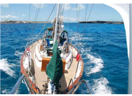
Work by Stacy Hall

"I love the vivid colors of the Bahamas, and the ability to travel into very remote locations and live closely with nature without the distraction of commerce,