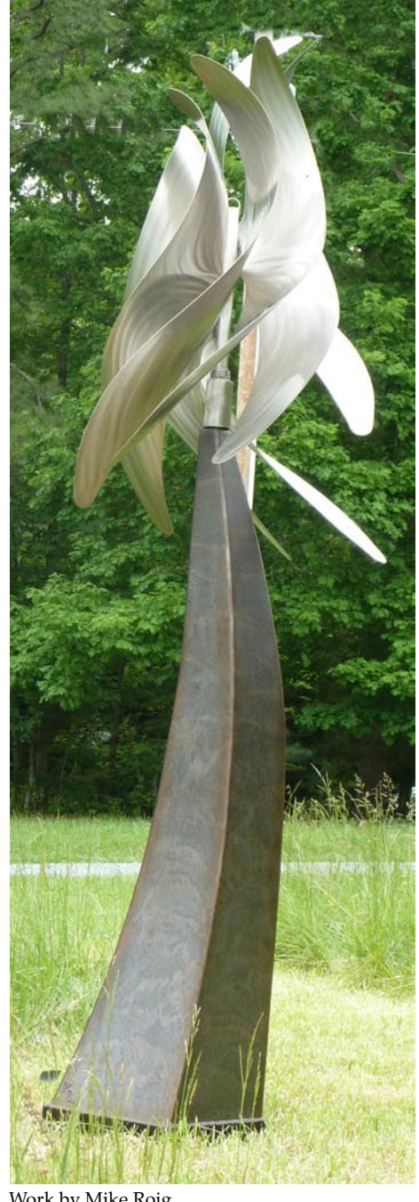
Work by Mike Roig

'Creating sculpture for the spaces was an obvious next step," adds Jordy. "Mark believed in (and still does) developing the 'bones' of the garden first. Bones are the evergreens and plants that form the structure, that are very evident in the winter landscape. While these trees were first starting out they needed room and it was the perfect place, again, for sculpture that could be moved once the space was needed. I was hooked, and my work eventually went from indoor sculptural vessels to full size figures. We started to