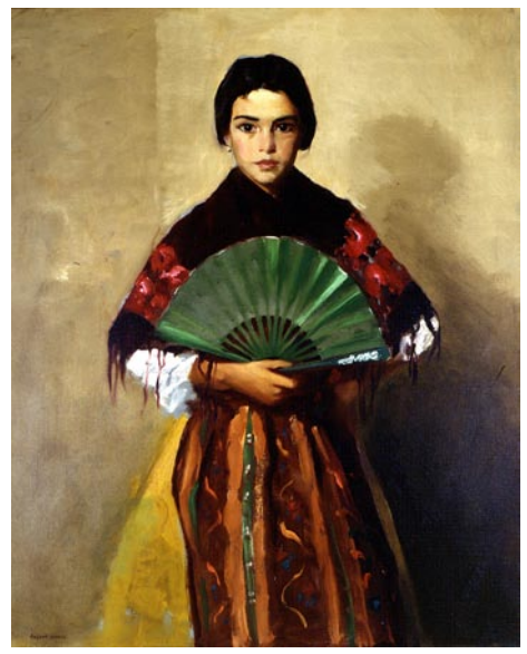
Work by Robert Henri

on, SC, will present People's Choice: A Community Curated Exhibition, on view from May 3 through Sept. 15, 2013.