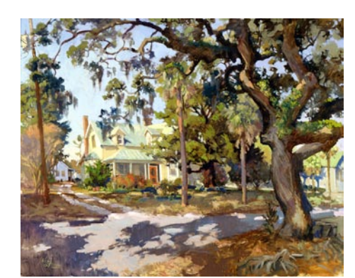
Work by West Fraser

On May 9, at 2:30pm - Curator led tour of People's Choice. Free with museum