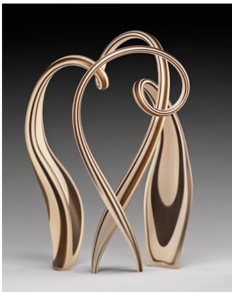
Work by Greg Fidler

Kalā - A Contemporary Craft Gallery , 100 W. Union Street, at the intersection of W. Union and S. Sterling Streets, across from the Historic Burke County Courthouse, Morganton. Ongoing - Kalā is a retail contemporary craft gallery featuring handcrafted art made in America that is affordable to everyday people. Rep-