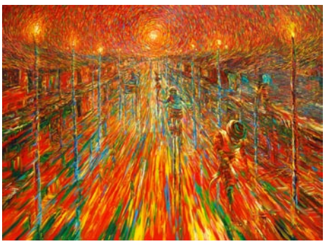
Work by Lorez (Nelo) Arquimides