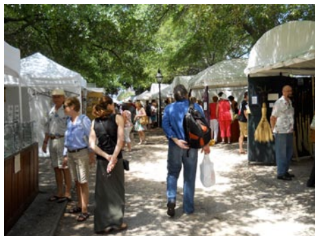
There is plenty of shade in Wragg Square Park

The shows will again include our popular silent auctions. The auctions feature craft objects donated by our participating artists and by members of Charleston Crafts Cooperative. Each show will feature a separate silent auction selection.