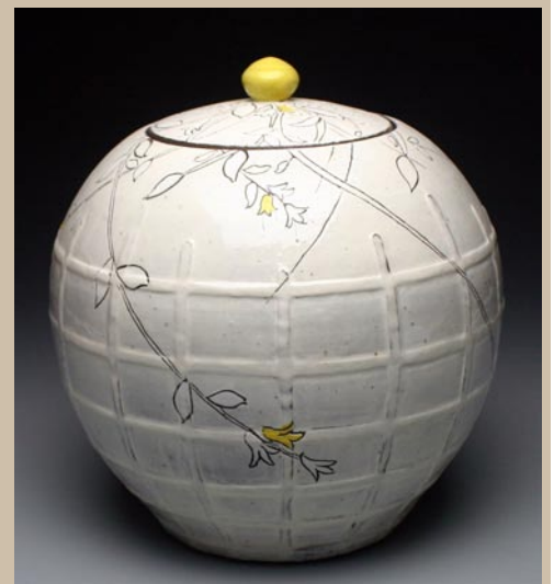
Work by Ben Carter

If you like what you hear you might want to sign up for the newsletter. To join the list click the following link and sign up in the box below the streaming player: ( http://www.carterpottery.blogspot.com/2009/05/welcome-to-tales-of-red-clay-rambler.html ).