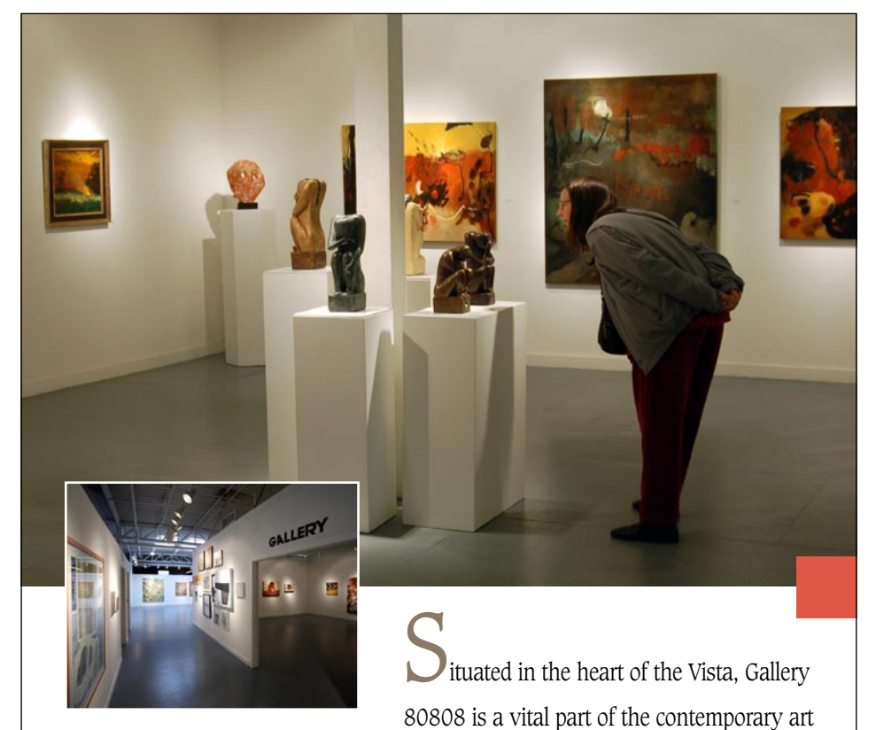
Exhibit in the Heart of the Columbia Vista

scene in the Columbia metropolitan area.