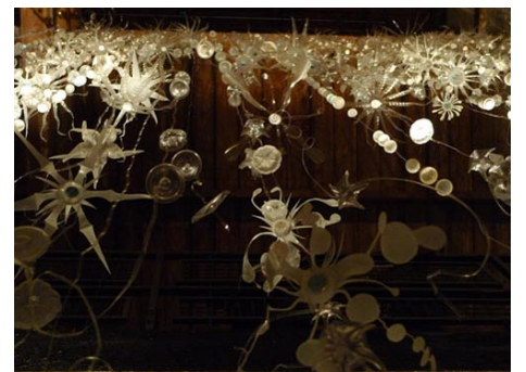
Work by Aurora Robson

Aurora Robson: Stayin' Alive is the artist's first major solo exhibition in the Southeast. Featured will be new suspended and wall-mounted works and a site-specific installation assembled from plastic debris. The exhibition's title references a wide-awake vigilance, whimsically asking us to consider what exactly staying alive on earth entails? Consider the unnerving fact that all the plastic ever produced still exists and will remain on earth long after we are gone: