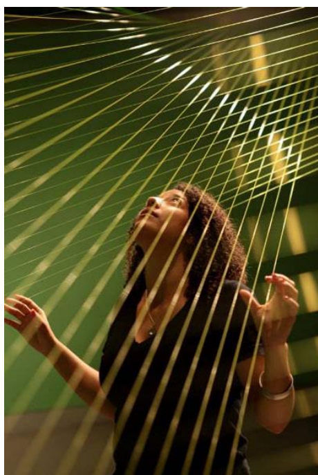
Work by Andi Steele

Kyle Worthy is an abstract landscape photographer living and working in Charlotte. The action of taking a photograph is