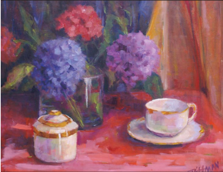
FEATURE ARTIST PATRICIA PITTMAN

323 Pollock Street • New Bern, NC 28560 Hours: Monday - Friday 10:00 am - 6:00 pm Saturday 10:00 am - 5:00 pm • 252.634.9002 www.fineartatbaxters.com