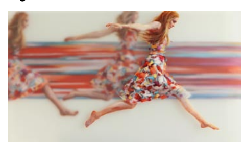
Work by Michelle Jader

"Inspiration struck after painting a series of studies on vellum-style mylar and stacking them on each other. The mylar's slight transparency combined with my expressive and slightly chaotic brushwork, allowed for a layered effect that seemed to vibrate with motion. This is when I realized that