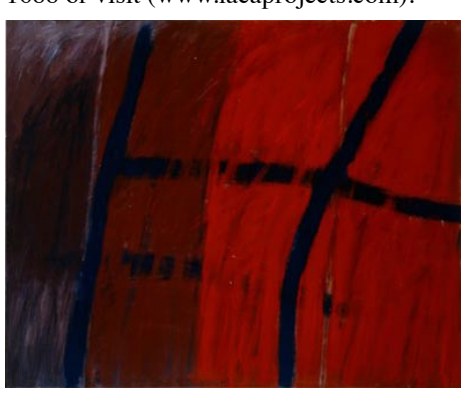
Jack Tworkov "Barrier #5," oil on canvas, 64.5 x 80 inches. Estate of Jack Tworkov, New York.

works from some of the participating artists. For further information call 704/837-1688 or visit (www.lacaprojects.com).