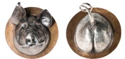
Works by Logan Woodle

Edgefield and Greenwood Counties, May 2 - 3, 2015 - "4th annual Heritage Trail Pottery Tour & Sale". Visit 5 pottery studios (over 20 potters) in Edgefield and Greenwood counties and the Groundhog kiln opening in Edgefield. The tour is sponsored by the Greenwood Area Studio Potters (GASP), a group which was formed by current and former students of the professional pottery program at the Edgefield campus of Piedmont Technical College. For a detailed schedule of events or to receive the official Heritage Trail Pottery Tour brochure visit ( www.facebook.com/HeritageTrailPotteryTourSale ) or e-mail to ( bellhousepottery@gmail.com ). Greenwood and Edgefield counties are both located along the SC National Heritage Corridor. Hours: Sat., 10am-5pm & Sun., noon-5pm. Contact: Dohnna Boyajian at 864/554-0336 or e-mail to ( dcollinsboyajian@gmail.com ).