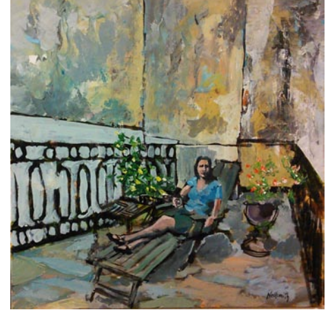
Work by Bruce Nellsmith

"Drawing and painting on location will 'emboss' the experience of being present (in the midst of the subject) on one's memory and in one's soul, but even more draw-