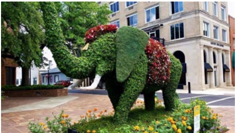
One of the topiaries you'll find along the street

Celebrating the grand opening of 50 Blooming Years, a historical exhibit about the SC Festival of Flowers, The Greenwood Museum welcomes the public to come view the Festival's 50th anniversary special exhibit. It will feature artifacts and memorabilia such as the SC Festival of Flowers Princess crown and a coach used in the festivities over the first 30 years. People are generously sharing their programs, brochures, photos and other items as well as some of the winning creations of the Arts & Craft Show over the years.