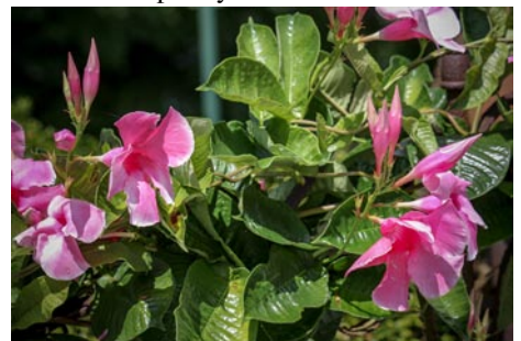
And of course there will be lots of flowers

The event features original work from talented artists and crafts people from all over the Southeast. All juried exhibitors' work has been handmade by the exhibitors and must be their own original design and creation. See the creative process in action with several of our exhibitors demonstrating their craft in their booths, something for every taste and budget with items from the most contemporary to the most traditional.