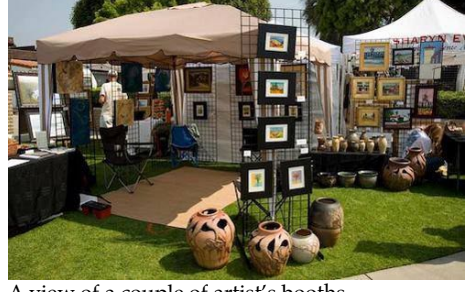
A view of a couple of artist's booths

The South Carolina Festival of Flowers Juried Art Show is a sanctioned event hosted annually by The Arts Center of Greenwood in coincidence with the South Carolina Festival of Flowers. The exhibit celebrates its 11th year in The Arts Center's main gallery in 2017 and will feature work from artists all over South Carolina and divisions of the southeast. The show will be on display during the month of June at The Arts Center. The event is presented by the Arts Council of Greenwood County.