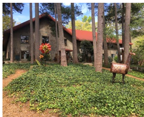
A view of Groewood Gallery

Groewood Gallery opened in 1992 when the city was just beginning to enjoy a cultural and artistic renaissance. Tucked