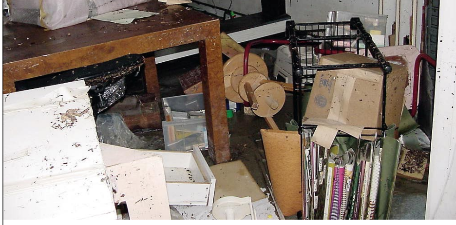
Artist Diane Falkenhagen's Texas studio — destroyed by flooding during Hurricane Ike, 2008

What would you do if you lost your work, your tools, your images, and a lot more to a flood? Metalsmith Diane Falkenhagen knows