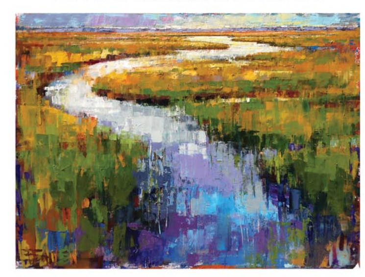
CURT BUTLER MOTHER'S DAY WEEKEND May 12 & 13