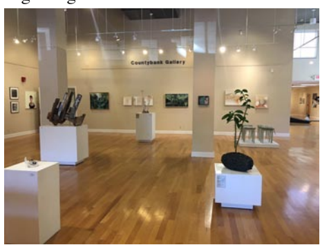
View of 2017 Juried Show at The Ars Center

We invite you to stroll among our larger than life, "living" topiary sculptures spread throughout the Uptown Greenwood square. Then come browse and shop our arts and crafts show, take in various performances, experience our Wine Walk, join in our 5K run/walk, engage in Kidfest and tour exquisite home gardens. And that is just the beginning