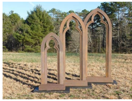
Sculpture by Beau Lyday

Visual art offerings unique to this year's festival include Honduras: Nuestro Arte, Nuestra Vida , an international group exhibition featuring painters from