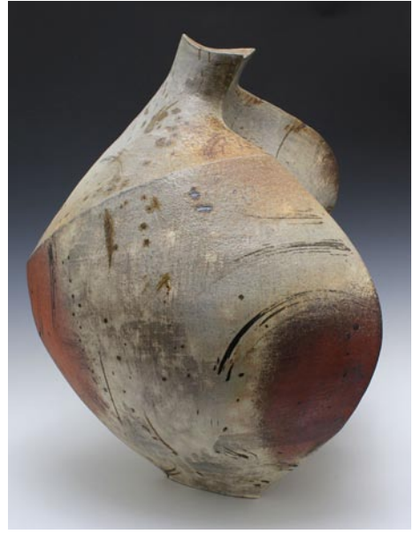
Work by Takuro Shibata

Our policy at Carolina Arts is to present a press release about an exhibit only once and then go on, but many major exhibits are on view for months. This is our effort to remind you of some of them.