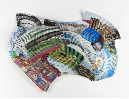
"Autobiography: East/West (Gardens)" by Howardena Pindell (American, 1943-)

The Mint Museum Uptown, at the Levine Center for the Arts in Charlotte, NC, is presenting Under Construction: Collage from The Mint Museum , on view through Aug. 18, 2019. This is The Mint Museum's first large-scale exhibition to explore the dynamic medium of collage. Although this artistic technique, in which materials are cut, torn, and layered to create new meanings and narratives, gained acclaim in the early twentieth century through the groundbreaking work of such artists as Pablo Picasso, Georges Braque, Kurt Schwitters, and Jean Arp, it experienced a renaissance (particularly in America) after World War II.