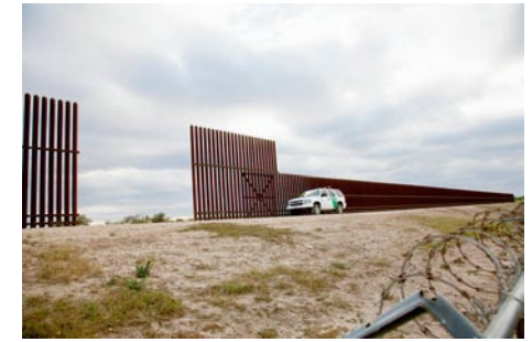
Work by Susan Harbage Page

Her work includes six monographs published by museums concurrently with exhibitions: Susan Harbage Page: Lo Strappo della Storia, Conversazione con Merletti/History's Pull, Conversations with