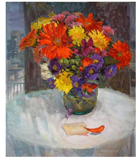
Work by Lyuba Titovets

browse among the eclectic garden finds in the courtyard including old gates, statuaries, pottery, unique iron pieces and so much more. Hours: Mon.-Sun., 9am-2pm. Contact: 843/958-0490 or 843/327-6282.