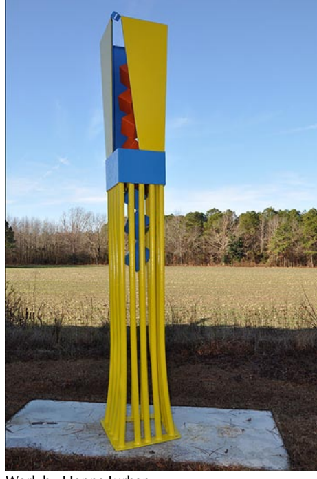
Work by Hanna Jurban 14th annual National Outdoor Sculpture Competition & Exhibition

Sculpture artists from across the nation were invited to participate in the 14th annual National Outdoor Sculpture Competition & Exhibition , on view at the North Charleston Riverfront Park, from May 1, 2019 through March 22, 2020.