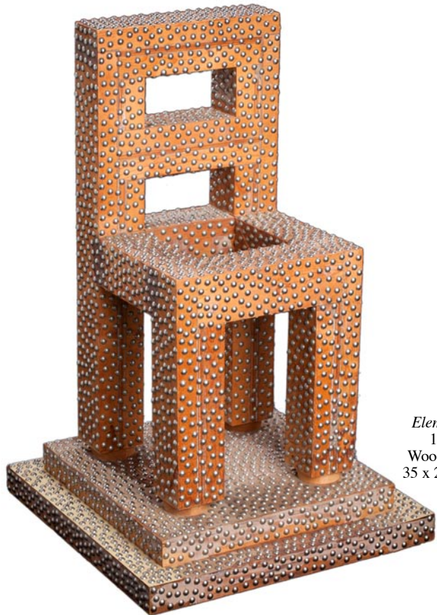
Elemental Chair 1988-1993 Wood, Aluminum 35 x 22 x 22 inches