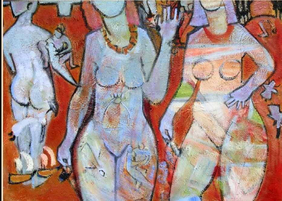
Judgement of Paris