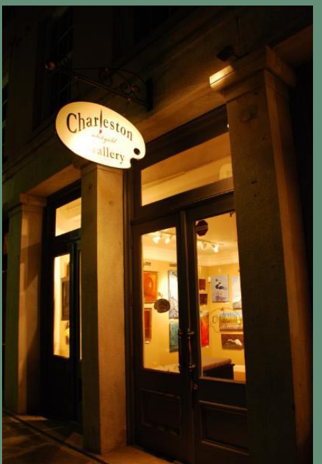
Work by Joshua Flint

160 East Bay Street Charleston, SC 843-722-2425 www.charlestonartistguild.com