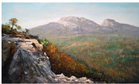
Work by Philip Moose

continued above on next column to the right