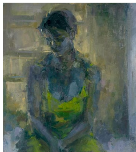
Katie Claiborne, M.A.S. Window II , 2009, oil on canvas, 36 x 32 in., Collection of the artist, © 2011 Katie Claiborne

The North Carolina Museum of Art in Raleigh, NC, is presenting the exhibit, Mirror Image: Women Portraying Women , featuring compelling images of women, from youth to old age, as seen through the distinct perspectives of 13 North Carolina female artists. The exhibition, in the Museum's North Carolina Gallery in the East Building will be on view through Nov. 27, 2011.